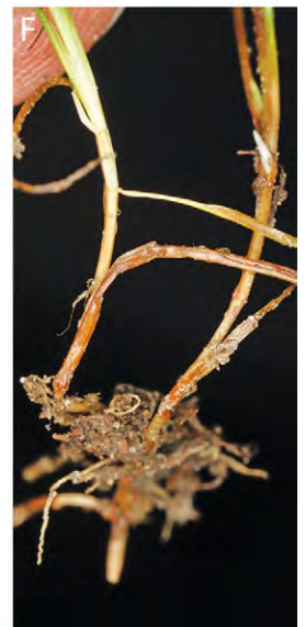
A- lakeside habitat in circled area, B- whole plant, C- immature flower head with stamens and filaments, D- fine leaves and flower head shorter than leaves, E-capsule with distinctive tip and tepals, F- creeping rhizome.