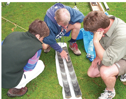
The excitement of a freshly opened core exhibiting its layered history of climatic events.

One feature familiar to lake swimmers is the oozy mud on the bottom. This material is about 30 cm thick, and is a corer’s nightmare. The mud slops around in the core tube, mixing layers into an indecipherable soup. This problem was resolved by using an “icebox corer” – a wedge-shaped box filled with dry ice. It is gently lowered into the soft bottom where the dry ice freezes the surrounding sediment. This solidified mass is returned to the surface with the original layering intact.