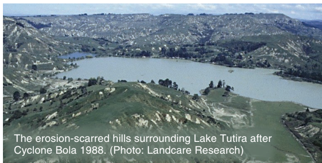
The erosion-scarred hills surrounding Lake Tutira after Cyclone Bola 1988.