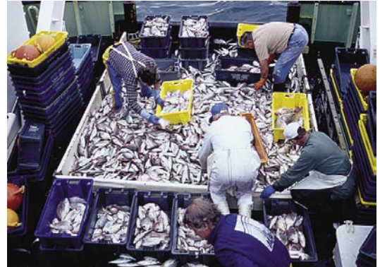
Sorting the catch from a research trawl survey.

The first step in this project was to identify those environmental and biological factors likely to have functional links with species distributions, and to then find suitable data describing their spatial variation. For example, primary productivity is likely to provide a good measure of food availability, particularly for smaller fish; to capture spatial variation in this we used satellite imagery describing average chlorophyll concentrations at the sea surface. Similarly the frequent concentration of food resources along fronts where water masses meet was described using a satellite-based data layer that identifies areas with strong spatial gradients in sea-surface temperatures. We estimated temperature and salinity, which have a direct physiological effect on fish, at the depth of each trawl from the CSIRO Atlas of Regional Seas (CARS), a regional ocean climatology that describes 3-dimensional variation in water characteristics and includes coverage across the New Zealand region south to 50°S. Estimates of the strength of tidal currents were derived from the NIWA tidal model.