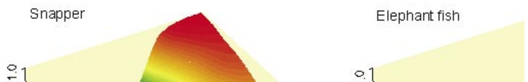
Predicted probabilities of capture for three fish species in relation to water temperature and relative salinity at trawl depth. Red colours indicate high probabilities of capture.