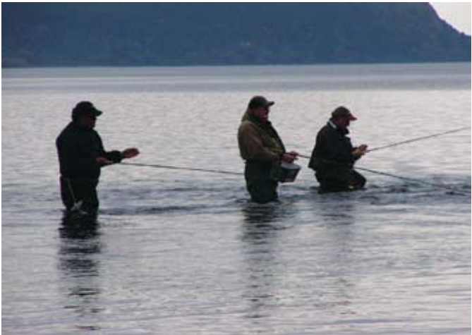
Taupo's world-class fishing is one of the amenities nutrient trading can help protect.

In the first year of the study we developed and tested a protoype N-Trader. Over the next two years we'll use the model to investigate the effects of changing commodity prices, farming practice, nitrogen-mitigation measures, and the size of the cap on the behaviour of farmers, changes in land-use, and impacts on the local economy. It will also be used to investigate different options for nutrient trading schemes at Rotorua and elsewhere in New Zealand. Our results will help identify the strengths and weaknesses of nutrient trading schemes. Some advantages and disadvantages are already apparent, and this project will explore these in more detail.