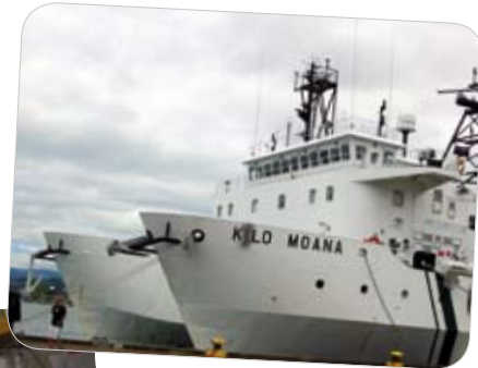
Drilling cores during MARGINS: Source-to-Sink (top to bottom): the twin-hulled research vessel Kilo Moana ; selecting the next drill site; recovering a piston core; removing a short core; rigging the box corer.