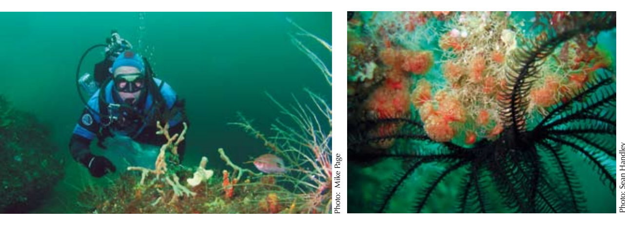
In the hunt for new compounds, divers collect samples of a wide variety of marine plants and animals, such as these crinoids (feather stars) and ascidians (sea squirts) found on black coral in Doubtful Sound.

Nature abounds with potent chemicals that protect organisms from disease, predators, and competitors (particularly useful for organisms that can't move away from harm, such as plants and sponges). The chemicals include venoms of tropical sea snails that have been harnessed for painkillers, and defensive chemicals found in sea sponges, now showing promise as anti-cancer drugs. The beauty of these natural compounds is that they have already been tested for their potency over millions or billions of years of evolution.