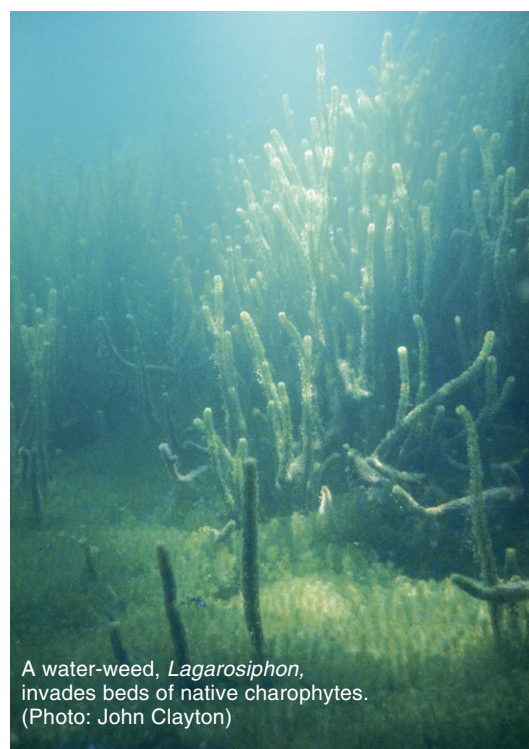
A water-weed, Lagarosiphon, invades beds of native charophytes.