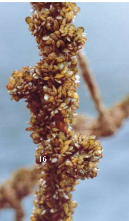
Mussel spat attached to a culture rope.

As spat grow, their preference for settlement-surface changes. Very small spat like fine, filamentous materials such as finely branched seaweeds and Christmas tree rope; larger spat