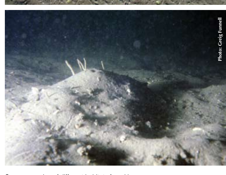
Some examples of different habitats found in New Zealand nearshore coastal areas. top to bottom: A flock of swan foraging in seagrass as the tide retreats. Cockles in the intertidal flat. Worm mounds and tubes create areas for animals to feed and hide out. left: Seagrass meadow at low tide.

that fish can use, including shellfish beds, rubble patches, and sponge gardens.