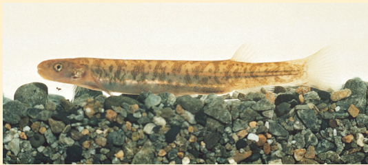
Dwarf galaxias.