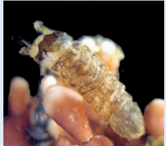
A new species of Joeropsis (Joeropsididae) taken from coralline turf algae collected from Island Bay, Wellington.

Although asellotes are predominately deep-sea, 13 families have shallow-water representatives. Many species are common on rocky shores, living, for example, in coralline red algal turf (patches of low-growing red seaweed) in the intertidal zone. However, it is in the deep sea, particularly at depths over 500 metres, where these animals come into their own. Most of the isopods here are asellotes. Some individuals from the genus Storothyngura (family Munnopsididae) have even been found at the phenomenal depth of 8430 metres in the Kurile–Kamchatka Trench in the north-west Pacific. This is not only one of the deepest known