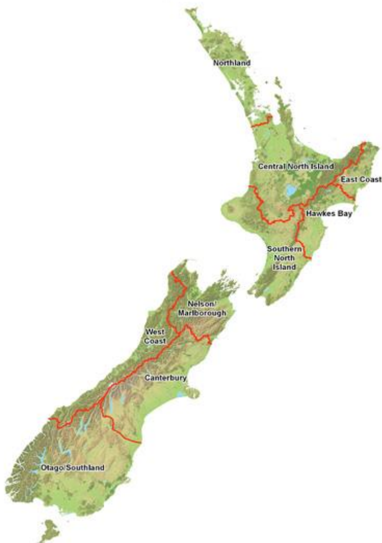
Figure 3-1: Map of the nine New Zealand forestry regions.