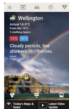
Sun Protection Alert mobile phone app (design only)

To support the promotion of the Alert, printed resources such as cards and posters have been developed and distributed. During the past two years, resources have been distributed to local councils, large employers, pharmacies, public health units and schools, both directly and through health promoters.